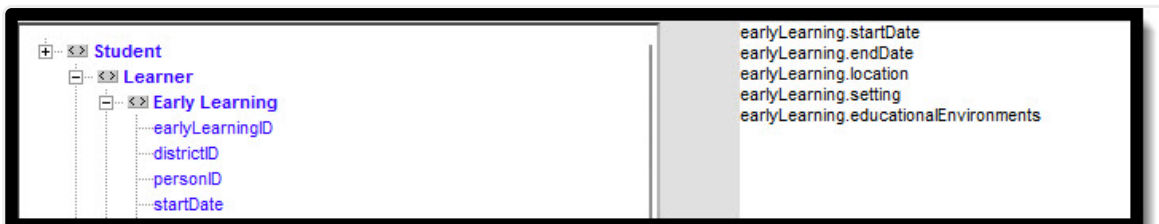
Ad hoc Fields - Early Childhood Detail Editor

In Ad hoc, Early Childhood Detail editor fields are located under Student > Learner > Early Learning.