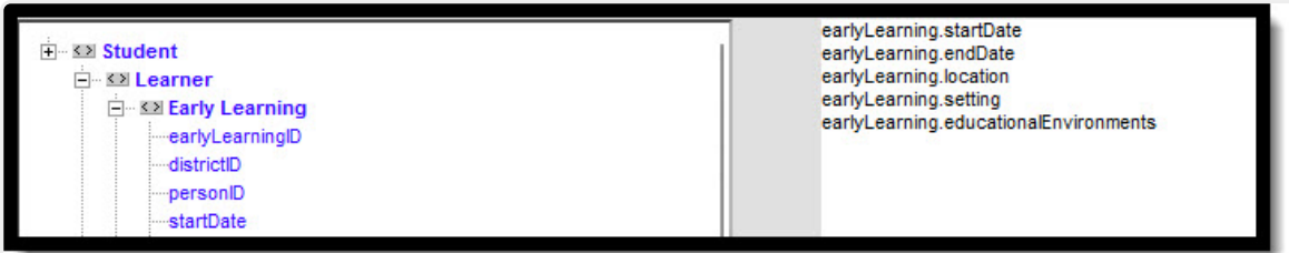
Ad hoc Fields - Early Childhood Detail Editor

In Ad hoc, Early Childhood Detail editor fields are located under Student > Learner > Early Learning.