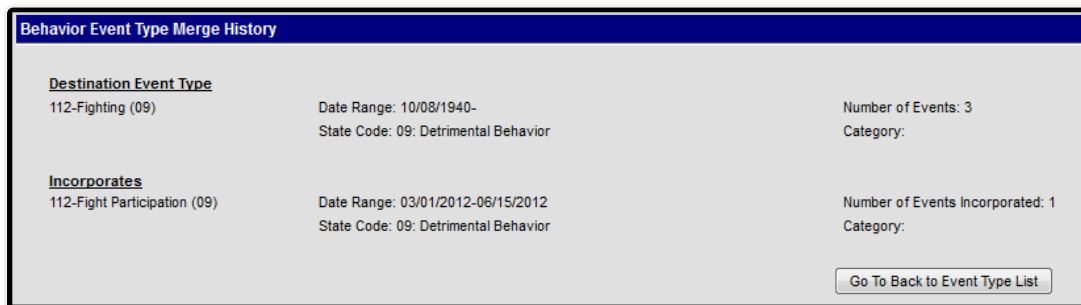
Summary of Merge

A summary of the complete merge displays, showing the destination type and the incorporated (source) type. Click Go Back to Type List to finish. The incorporated (source) type no longer displays in the type list.