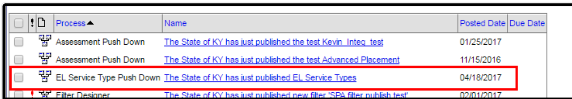
Process Alerts Message Indicating the State has Published an EL Service Type

Once Service Types are published, district users will receive a message in their Process Alerts (formerly Process Inbox) informing them of newly published service types.