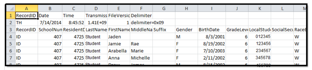
Student ID and State Locator Report Example - CSV Format