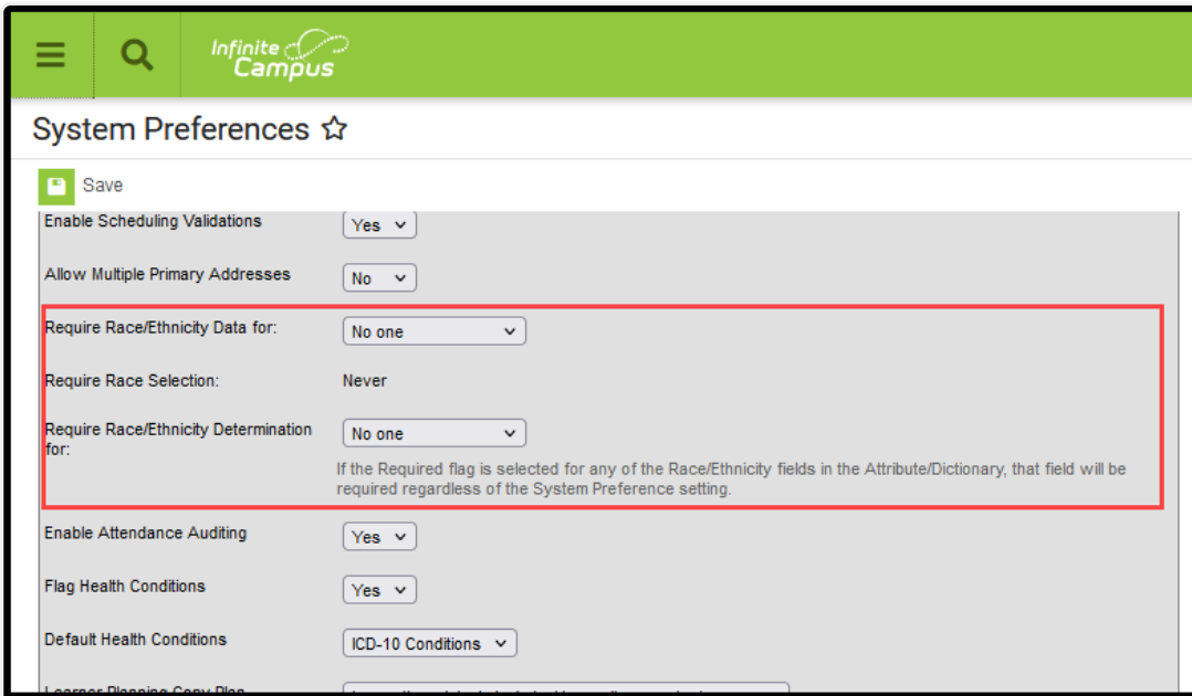
System Preferences for Race/Ethnicity Fields

Note that if any race/ethnicity field is marked as required in the Attribute/Dictionary, that setting overwrites any of the race/ethnicity System Preferences.