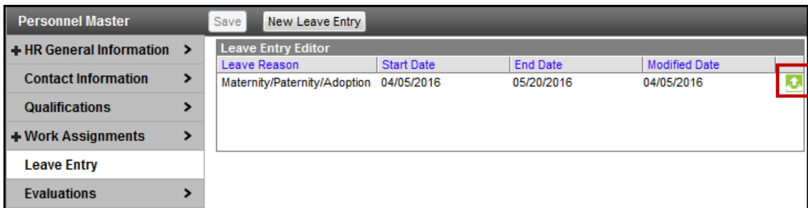
Example upload button for file attachments

This feature is only available if your administrator has enabled the attachment feature .