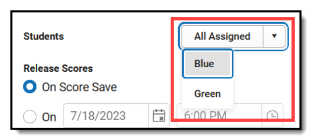
Student Groups in the Assignment Editor

You can use student groups to give assignments to only a subset of students in a section. Once a group is created, you can select it in the Scheduling/Grading Alignment area of an assignment. The assignment only appears for the students in the selected group; all other students are automatically marked as exempt in the Grade Book.